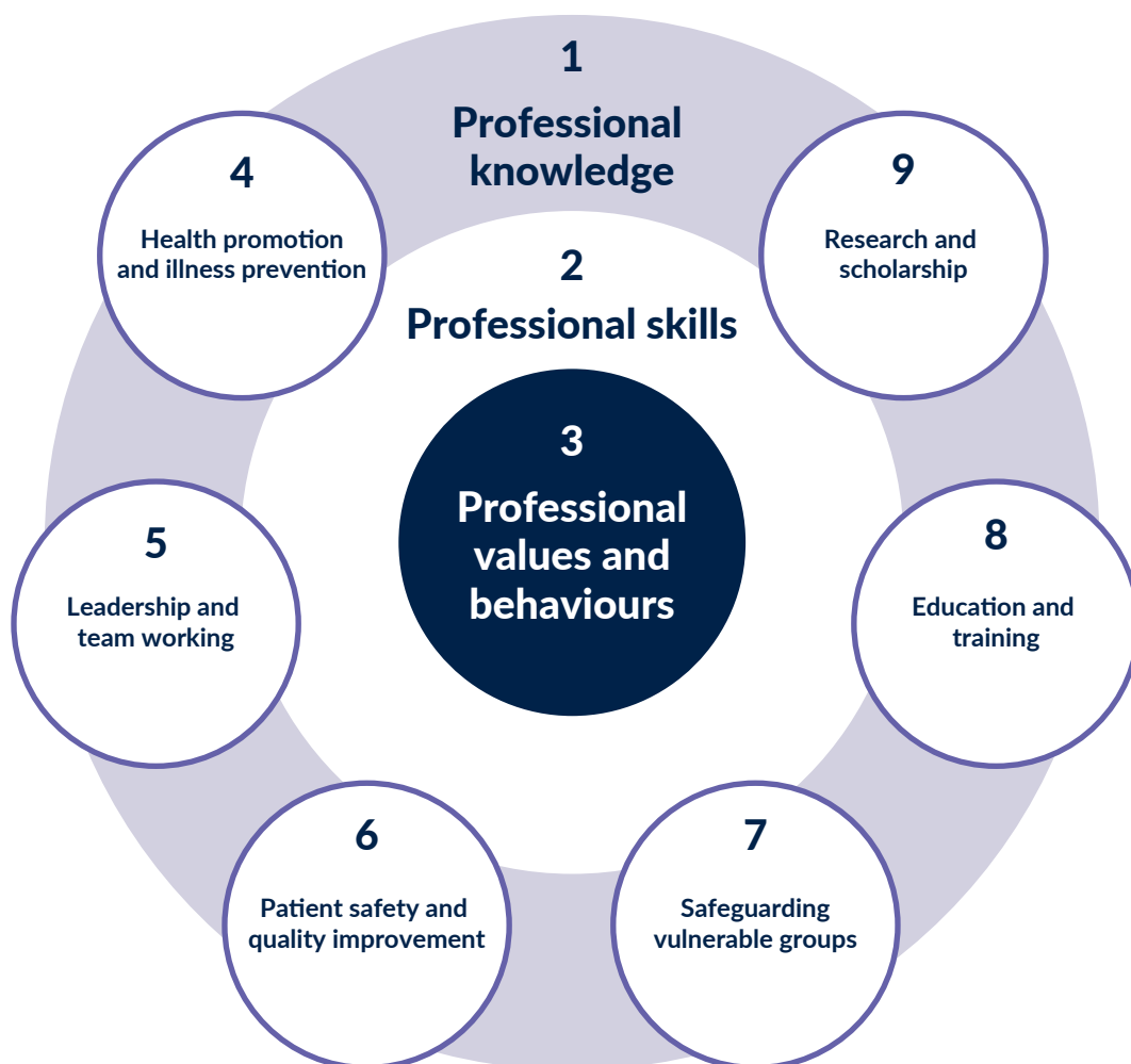
Figure 1: Generic professional capabilities framework

The 2019 GP curriculum is designed to integrate with the General Medical Council's (GMC) generic professional capabilities framework. 4 This framework describes the essential capabilities that support professional medical practice in the UK (see Figure 1).