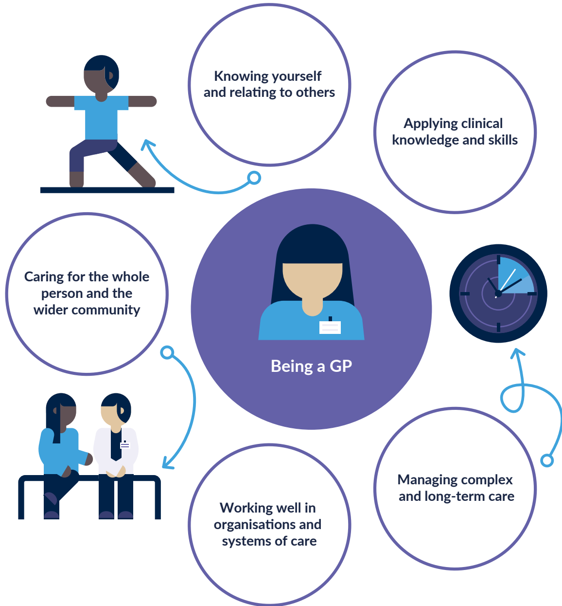
Figure 2: The five Areas of Capability in the RCGP curriculum for general practice